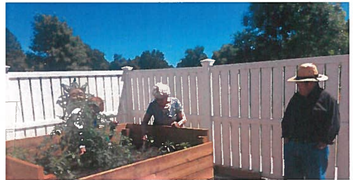
Residents enjoying our new Memory Gardens patio and raised garden bed. We planted tomatoes, peppers and onions in the gardens and the residents can't wait to enjoy the fruits of their labor!