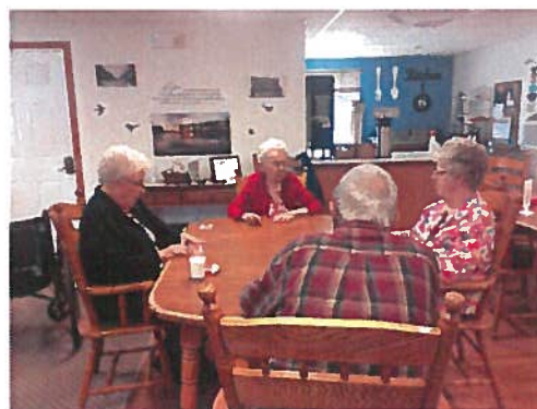
Residents in our Memory Gardens playing a fierce game of cards together. Playing cards is a favorite past time of all the residents at Arlington Place and you can find games most afternoons in either dining room.