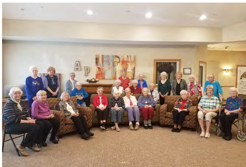
All of the Mothers from Arlington Place at Oelwein